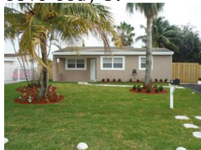
6810 Cody St

MLS#: H10213584 Status: CS Price: $225,000 SqFt: 1,084 Beds: 3 Bath: 1 (1 0)