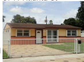
6741 Atlanta St

MLS#: A10248346 Status: CS Price: $230,000 SqFt: 1,268 Beds: 2 Bath: 1 (1 0)